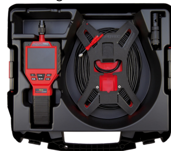
Symbolpicture - without content